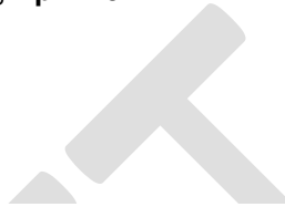
Figure 1: CBT 2019 Data Timeline